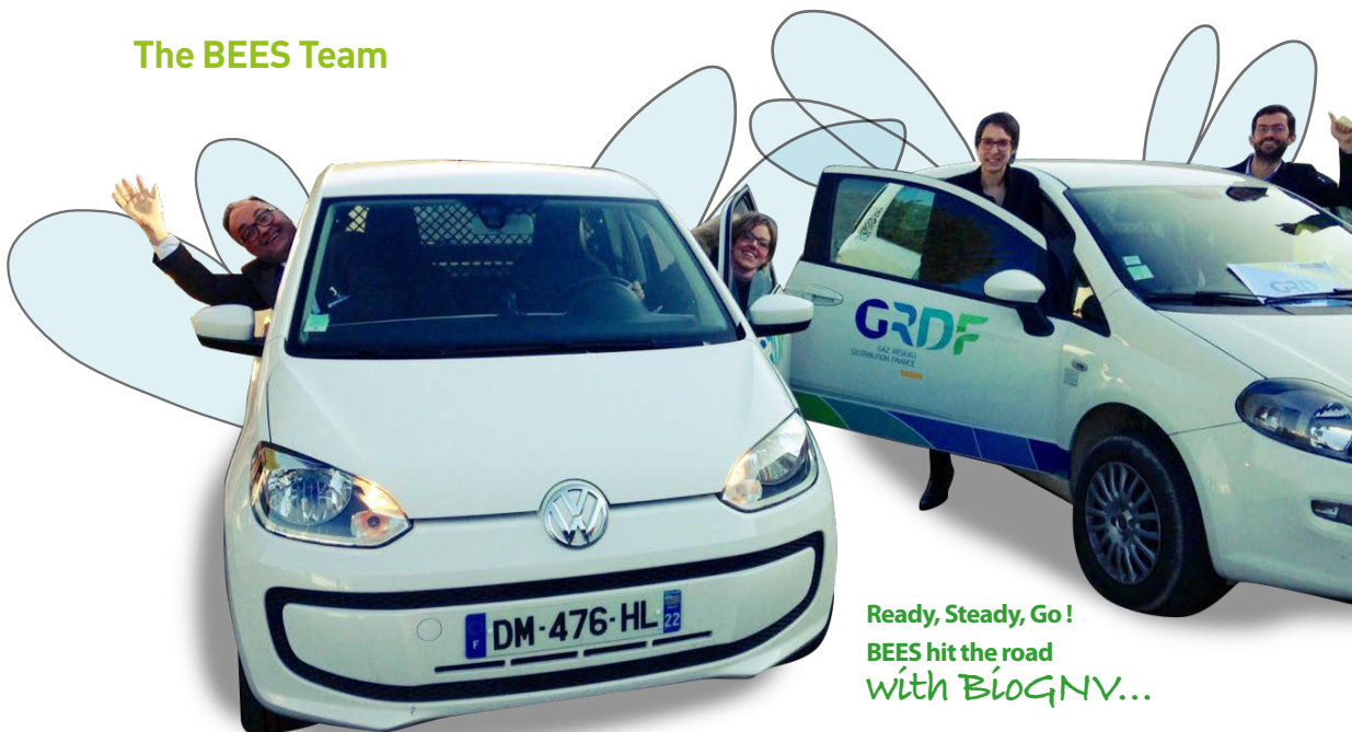
Ready, Steady, Go ! BEES hit the road with BioCNGV...